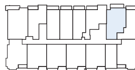
4 TH FLOOR